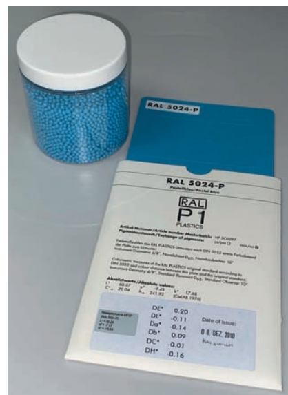
Fig. 2. RAL color charts serve as references for the analyses.

As the proportion of recycled materials in packaging increases, so do the imposed quality requirements. Consist-